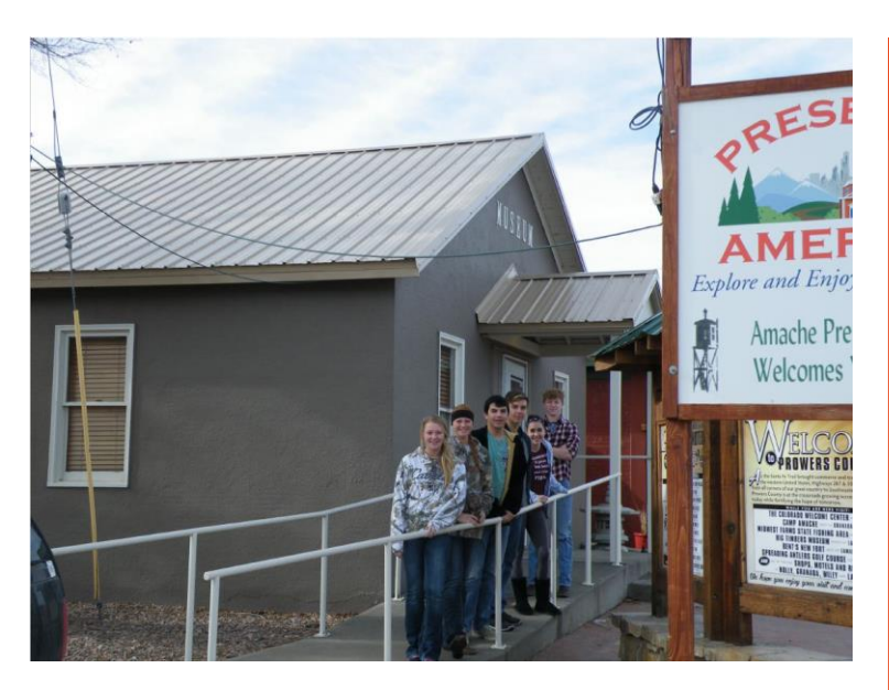
Granada High Amache Preservation students at the Amache museum