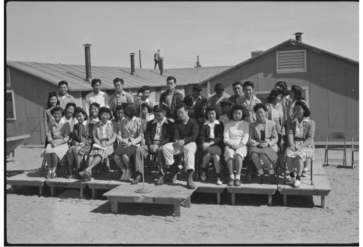
Amache High School Honor Society Members, 5/1943