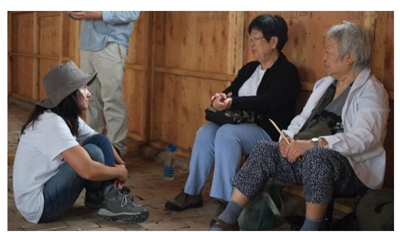
Conversations in the reconstructed barrack at Amache during the Open House Day, 2016.

The University of Denver will be returning to conduct research at Amache and the Amache museum in Granada, Colorado from June 12 through July 12, 2018. Our mornings will be spent doing archaeological research at the camp, while our afternoons will be devoted to the Amache museum collections. We are excited about continuing to work with the Amache Preservation Society on the new Amache Research Facility, a space that houses additional collections and serves as a research facility for visitors and archaeology crews.