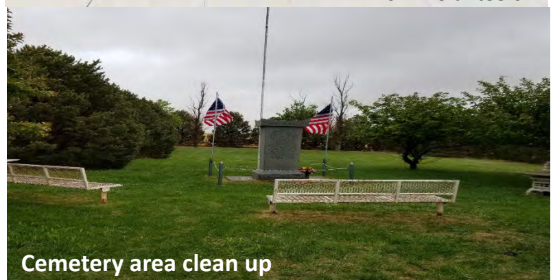
Cemetery area clean up