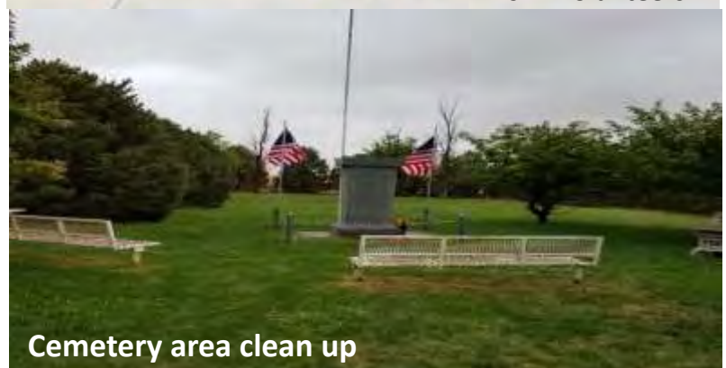
Cemetery area clean up